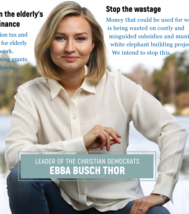
LEADER OF THE CHRISTIAN DEMOCRATS EBBA BUSCH THOR

“What is the Swedish welfare state worth if we cannot trust that we will receive care when we need it? If we don't look after the elderly and sick? If we don't stand up for what is right, then society will fall short.”